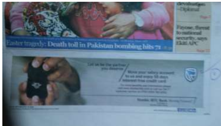
Fig. 12 Banking Service Adverts (the Punch , Tuesday 29 March, 2016, p. 1)