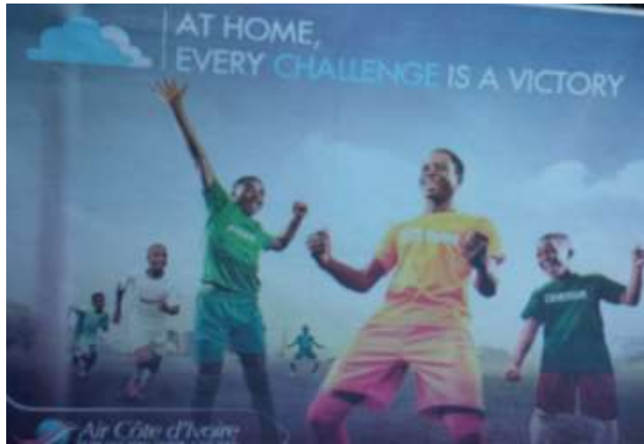
Fig. 8 Cote D'voire Airline Service Adverts ( the Guardian , Tuesday, March 29, 2016, p. 27)

The advertisement in Fig. 8 is multi-coloured. The different colours carry different messages. There are about six colours in the advertisement. Each person in that picture represents a nation in Africa. There appears to be an arrangement similar to the positioning of the African nations on the map of Africa. But for Cote d'voire which is at the centre of the advert the other nations are the neighbouring countries. The nations are graphologically arranged as Gabon, Senegal and Nigeria from the West and Cote d'voire conspicuously standing in the middle and Cameroon to the left of Code d'voire. The advertisement pictorially sends the message that Cote d'voire airline is big, strong and reliable across Africa and beyond. Thus, the airline is equal to the challenges confronting air travel in Africa. The Bold lettering AT HOME, EVERY CHALLENGE IS A VICTORY depicts that the exploits of air Cote d' voire have made the airline victorious. Through human pictures, the message is adequately conveyed clearly.