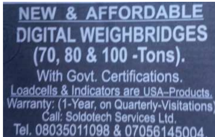
Fig. 9 Telecoms Service energy Adverts ( the Punch , March 29, 2016, p. 40)

The advertisement in Fig 9 from the Punch newspaper has the following graphological features