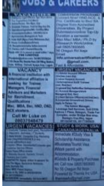
Fig. 7 Job Vacancy Adverts ( the Punch , Tuesday, April, 5 2016, p. 38)

Figure 7 has multiple adverts, each with different writing methods. Unlike the advertisement in Fig 6, other advertisements on this same page appear to be written in a hurry. Reasons for the jumbled arrangement of information could be that of cost or importance of the message on the particular page of the newspaper.