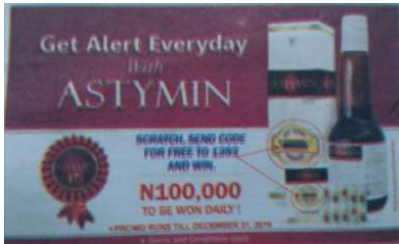
Fig. 13 Drug Adverts ( The Punch , Tuesday, March 29 2016, p. 37)