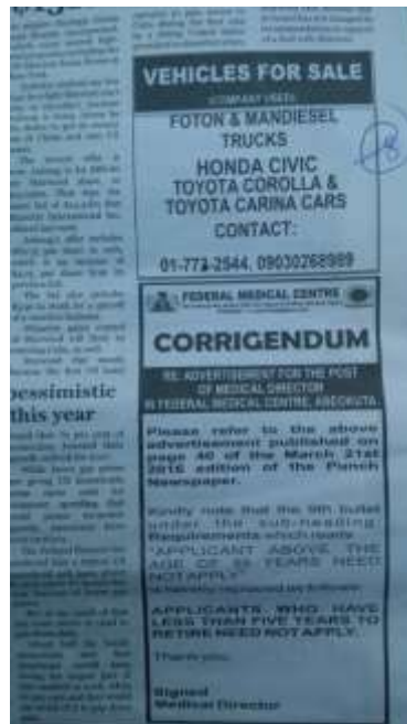
Fig. 10 Vehicle Sale Adverts ( the Punch , March 29, 2016, p. 40)

On the same page with the advert above, same Graphological features were observed.