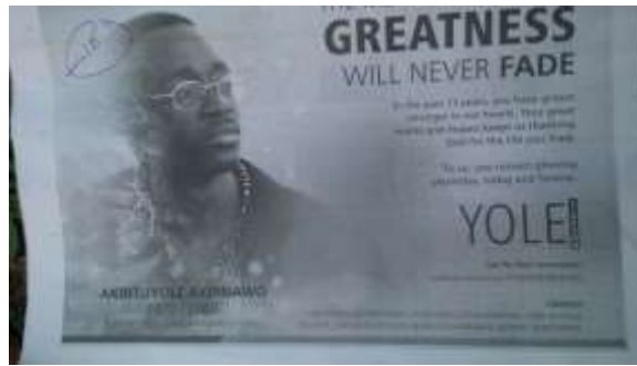
Fig. 4 Obituary Adverts (The Punch, Tuesday, March 29 2016, p. 50)