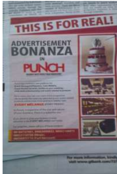
Fig. 3. Punch Newspaper Bonanza Adverts (the Punch , Tuesday, 29 March, 2016, p. 15)

The advertisement in Fig 3 is by the Punch newspaper. It is information for the public. The newspaper house is giving the public the opportunity to advertise events on pages of the newspaper. The advert assures them of spaces for advertising their events unlimitedly.