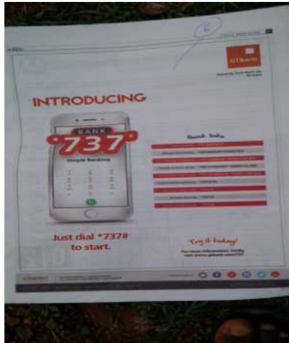
Fig. 1 Guarantee Trust Bank Adverts (The Punch , Tuesday, 22 March, 2016, p. 52)

The visible expressions in the figure above are: