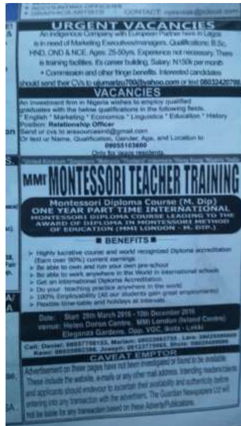
Fig. 6 Job Vacancy Adverts ( the Punch , Tuesday, March 29, 2016, p. 34)

Six sections are noticeable in Fig 6. The first section is the heading, which says “MONTESSORY TEACHER TRAINING, written in bold letters. The second section mentions the courses available at the training institution. The programmes include Diploma (M.Dip), the anticipated qualification is the MONTESSORY METHOD OF EDUCATION (MMI, LONDON – M.DIP). In the third section there are the BENEFITS highlighted in arrows. The fourth section has the DATE and the VENUE of the programme. The fifth section has the CONTACTS to be called while the last section has a CAVEAT EMPTOR to excuse the advertising newspaper from any fraudulent act in the bid to enter into any