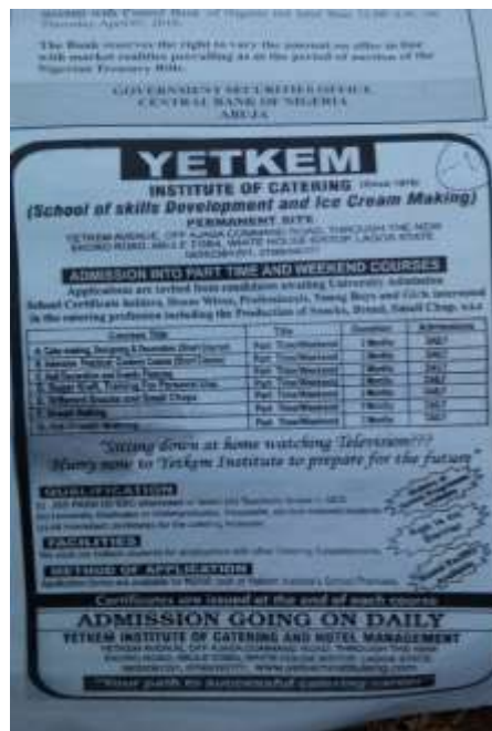
Fig. 11 Education/Admission Adverts ( the Guardian March, 29 2016, p. 23)