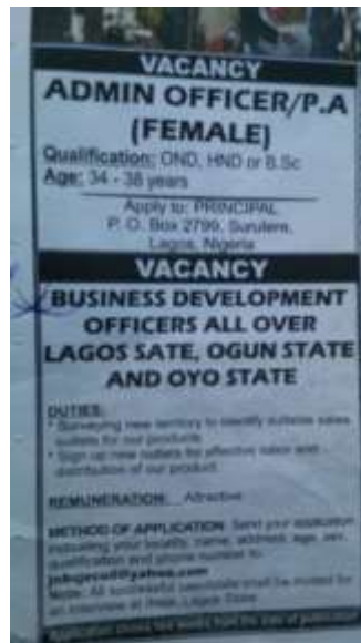
Fig. 5 Job Vacancy Adverts ( the Punch , Tuesday, March 29, 2016, p. 34)

Two adverts are placed in the same small space on the page. The first is that of an Admin officer and a Personal Assistant (PA). The boldly written part of the advert is the actual position that is to be filled. That is that of the ADMIN OFFICER . Also to be filled is the position of a PA . The qualifications expected include the Ordinary National Diploma (OND) and the Higher National Diploma (HND) or Bachelor of Science (B.Sc). In the second advert, the vacant position is that of BUSINESS DEVELOPMENT OFFICERS ALL OVER LAGOS STATE, OGUN STATE AND OYO STATE .